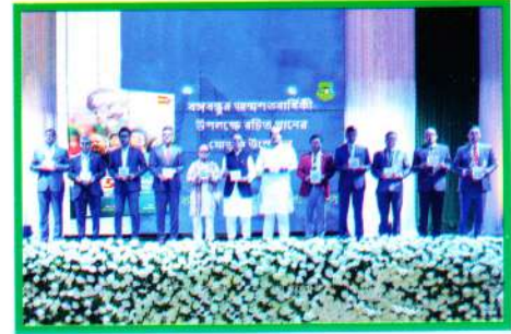
Releasing a Song Composed on the Occasion of Birth Centenary of Bangabandhu