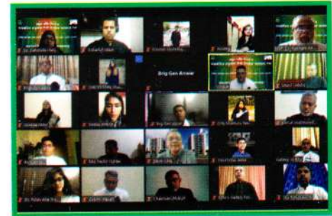
Respected Vice Chancellor Speaking at Martyrs' Day and International Mother Language Day