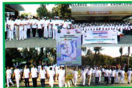
Glimpse of Bangabandhu Marathon