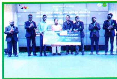
Winner Receiving Prize from Chief Guest at Quiz Competition