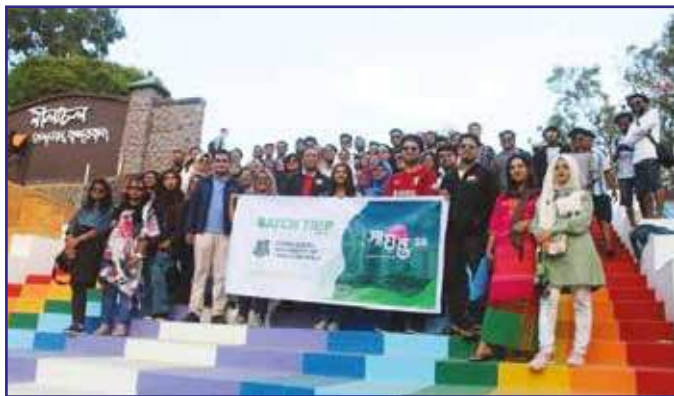
Department of Environmental Science, Batch BES-2019