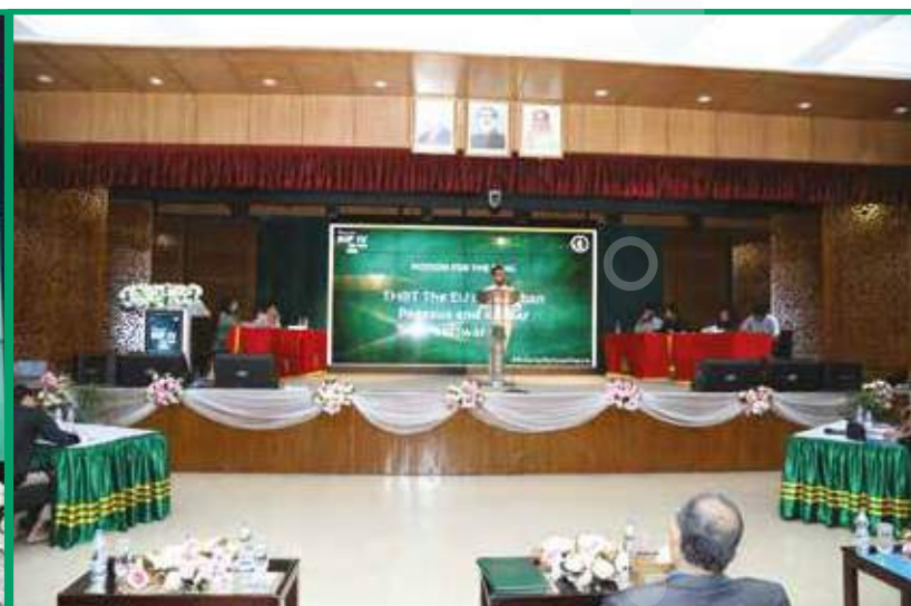
Inter University Debate Competition