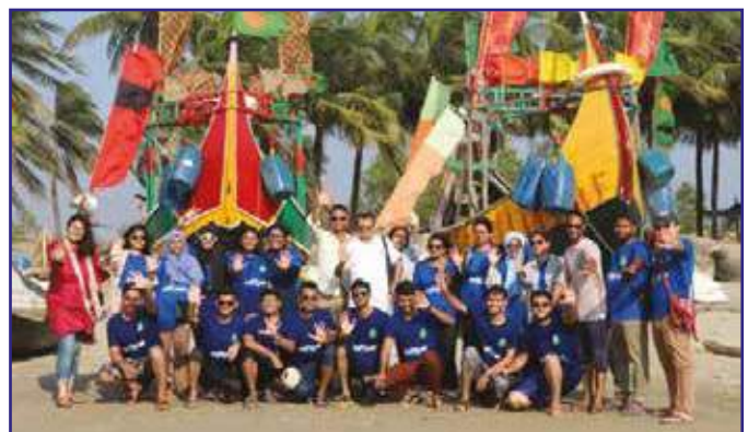
Department of Disaster Management & Resilience, Batch DMR 2019