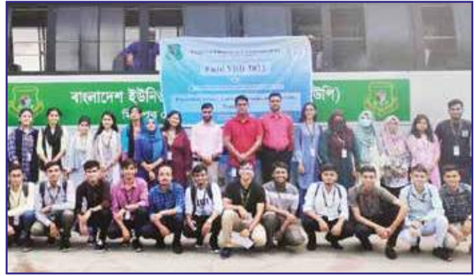
Department of Peace, Conflict and Human Rights, Batch BPCH 22