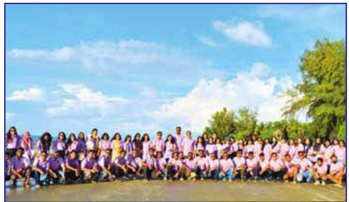
Department of Law, Batch Law 2019