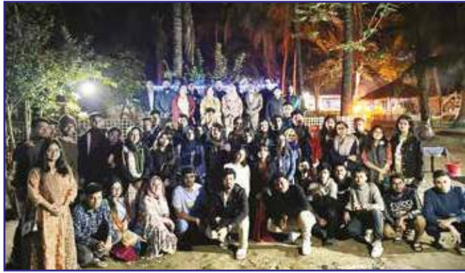
Department of International, Relations, Batch BIR 2019