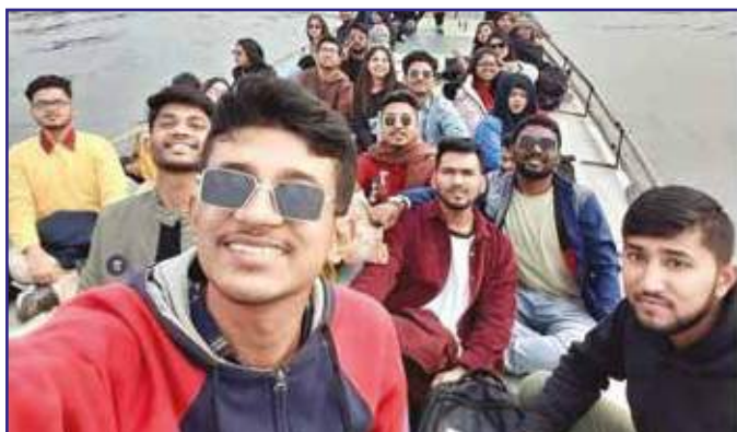
Department of Sociology, Batch Soc-2019