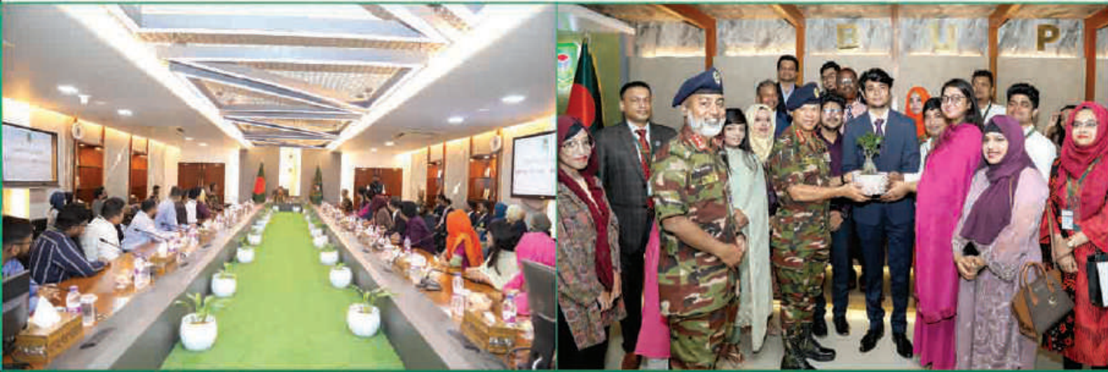
Interaction of Respected CAS with the Students of MBA Professionals